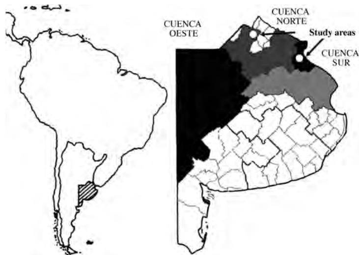
Figure 1. Map of South America showing the location of the Province of Buenos Aires (Argentina), its dairy basins and study areas.

Animals grazed daily on a strip of alfalfa ( Medicago sativa L.) pasture close to the dairy farm (100 m) and without supplements. During the experiment, the animals were not in the shade and had free access to a 3 m linear metal water trough.