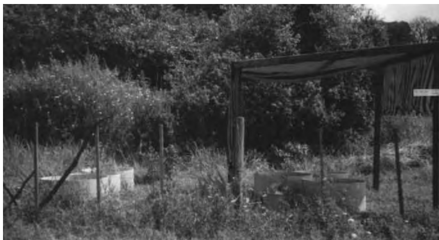
Figure 2. Circular water troughs placed in the sun and under 80% shade cloth structure.

The assay was carried out between 08 January and 13 January 2005 in the same dairy farm as in Experiment