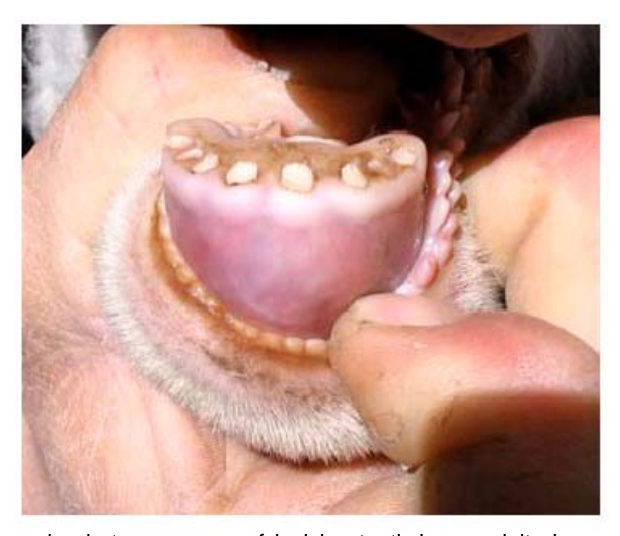
Figure 2. Excessive but even wear of incisive teeth in an adult sheep with only root stubs remaining.

Livestock exhibited excessive tooth wear following the PCCVE, being notable in cheek teeth, but particularly in incisive teeth. Prime-aged sheep had incisors evenly worn down to the gums (Figure 2).