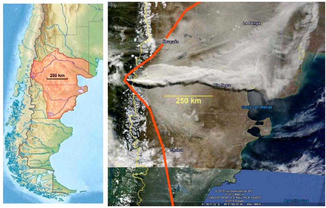
Figure 1. Distribution of tephra deposited from the Puyehue-Cordon Caulle volcanic eruption, showing the Moderate Resolution Imaging Spectroradiometer image of 13 June 2011, http://earthobservatory.nasa.gov. The red line marks the limit of deposition,

Although initial concerned about fluorosis, based on incidences from other Chilean volcanoes, only fluorine-containing microbubbles that may turn into fluorohydric acid upon contact with water were suggested to possibly occur in tephra (Bermúdez and Delpino 2011). Moreover, water-soluble extracts from tephra revealed low fluoride levels (0.7 ppm; Hufner and Osuna 2011), surface water analyses from both countries revealed low fluoride levels, and overall water consumption was considered without risk for humans and animals (DGA 2012; Wilson et al. 2012). Still, livestock losses in the region receiving tephra were high, but attributed to inanition, rumen blockage and excessive tooth wear, rather than to known toxic elements (Wilson et al. 2012). Apparently only one Chilean analysis was conducted on fluoride levels in forage plants and animal tissues from the PCCVE: forage fluoride levels were >3-fold higher than accepted levels, while levels in tephra and blood from livestock were also elevated (Araya, cited in Flueck and Smith-Flueck 2013). Given these observations in Chile and overt fluorosis documented from the nearby 1988 eruption, reasons for absent fluorotic cases from PCCVE remained elusive.