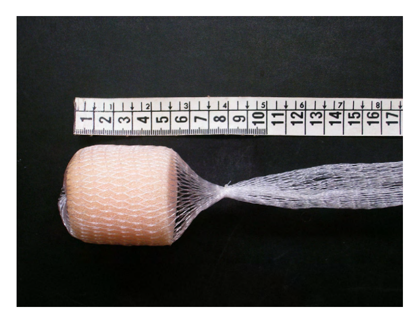
Fig. 1. Intravaginal sponge (100 mg of MAP) contained within a plastic net (long = 45 cm).

manipulations of the transducer in the rectum and held with its longitudinal axis parallel to the hind. Excursions from the midline to both the left and the right side were undertaken to cover the entire uterus. The non-echogenic fluid-filled bladder could be identified immediately as a landmark in almost hinds. Pregnancy was diagnosed by observation of non-echogenic fluid in the uterine lumen or by the identification of one fetus (Fig. 2).